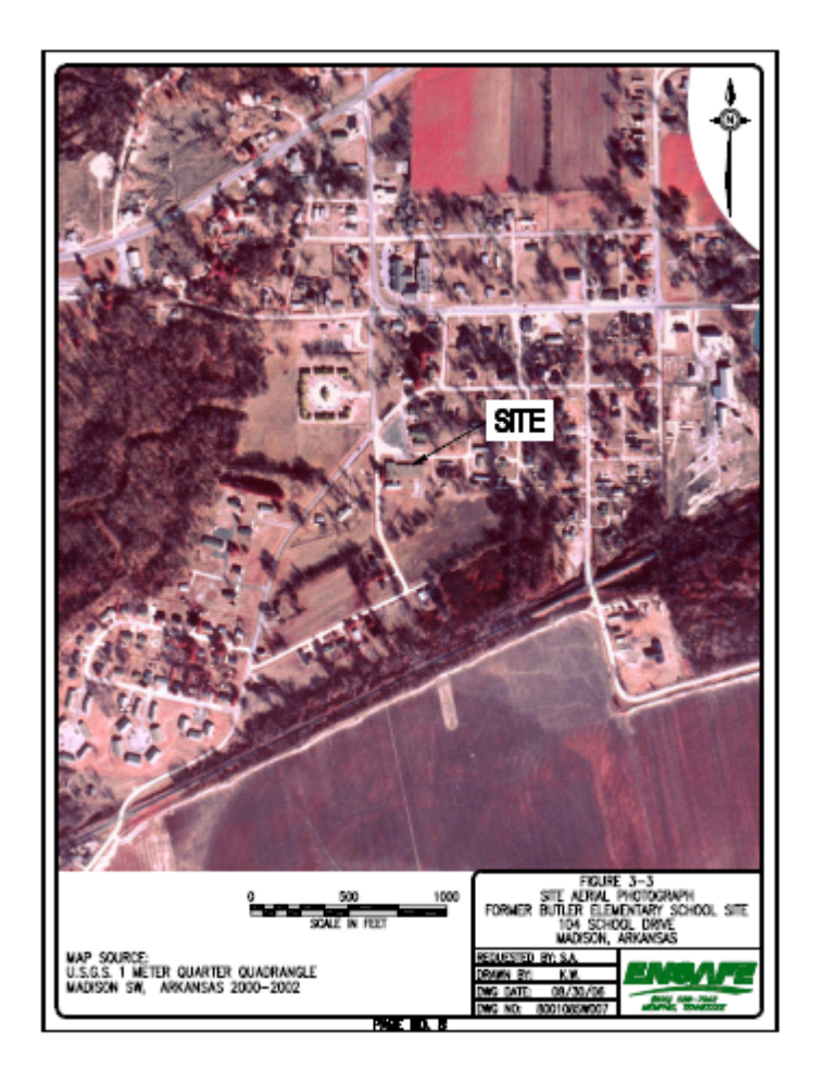
Site Diagram: Butler Elementary School