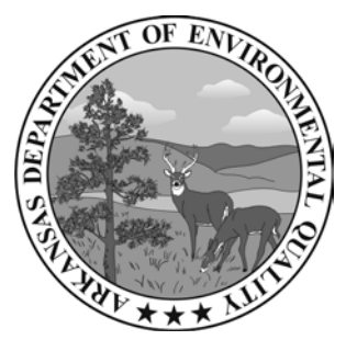
ADEQ 5301 Northshore Drive North Little Rock, Arkansas 72118